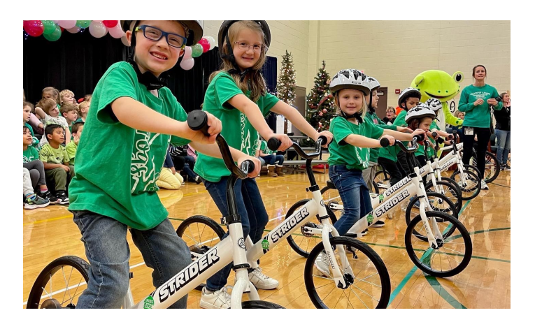
A grant was awarded to Meadowlands Elementary to launch the All Kids Bike program, which teaches basic skills and bike safety.