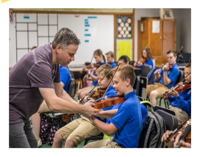
The Bluegrass Music Museum and Hall of Fame was granted multi-year funding to launch their Bluegrass Music Academy.