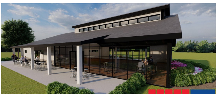
A $500,000 grant was awarded to the Western Kentucky Botanical Garden for their Pathway to Growth Capital Campaign. This gift will launch the design and build of the Pavilion which will be utilized for school trips and private rentals.